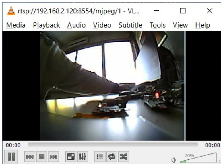
VLC Client stream