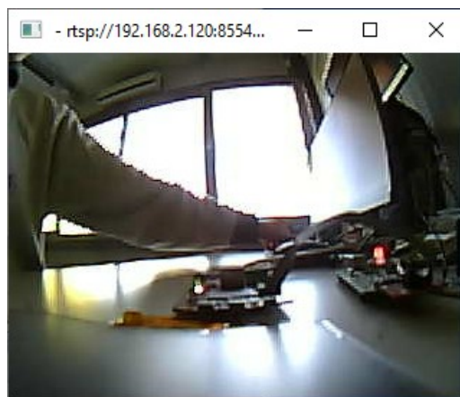
FFplay Client Stream

Insert ffplay rtsp://VK_RA6M3's_IP:8554/mjpeg/1 , hit Enter